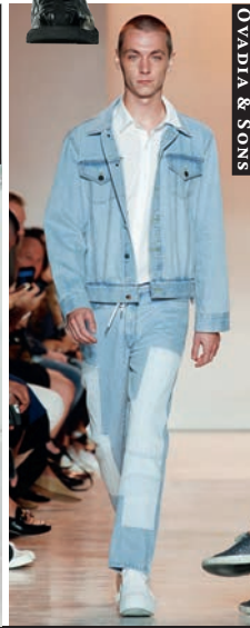
OVADIA & SONS