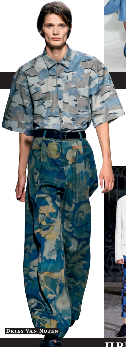
DRIES VAN NOTEN